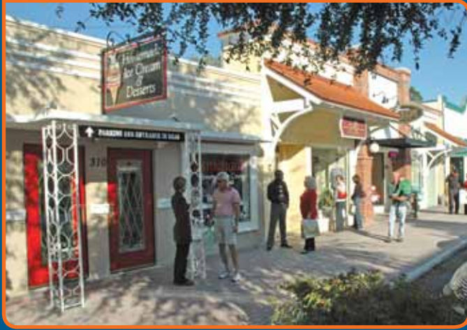
"Most Walkable Small City" – RunThePlanet.com