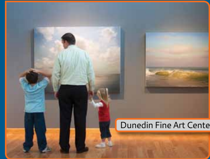
Dunedin Fine Art Center

Downtown Dunedin hosts more than 50 events each year. Hundreds more events take place throughout the community. There are multiple art and crafts shows, a traditional Mardi Gras celebration, Wines the Blues, the Scottish Highland Games and a Celtic Festival, as well as other special events with something for everyone.