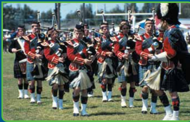
Pipers are a familiar sight when Dunedin celebrates its Scottish heritage at various annual festivals and concerts.

Join us in March for Spring Training for the Toronto Blue Jays. Our local Dunedin Blue Jays play from April to September.